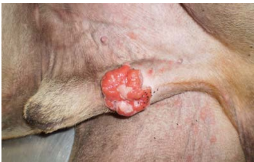
Fig.4 Significant remission of the lesion