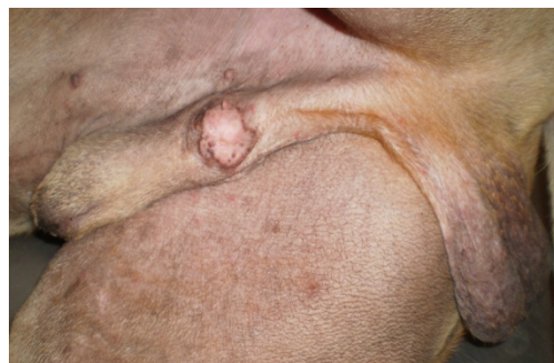
Fig. 5 Complete remission