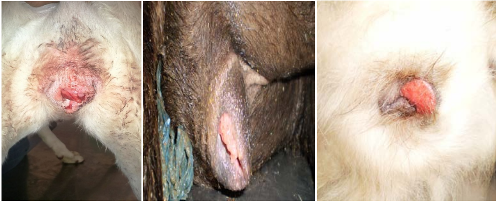
Fig. 1 Pedunculated growths at Vagina