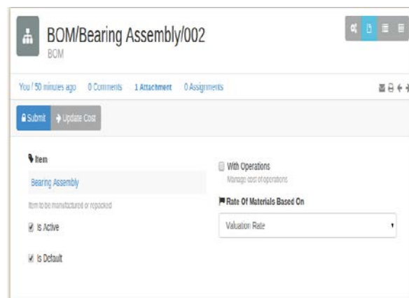
Fig 3 : Window of BOM for bearing assembly

3. Add the list of Items you require for each operation, with its quantity. This Item could be a purchased Item or a sub-assembly with its own BOM. If the row Item is a manufactured Item and has multiple BOMs, select the appropriate BOM.