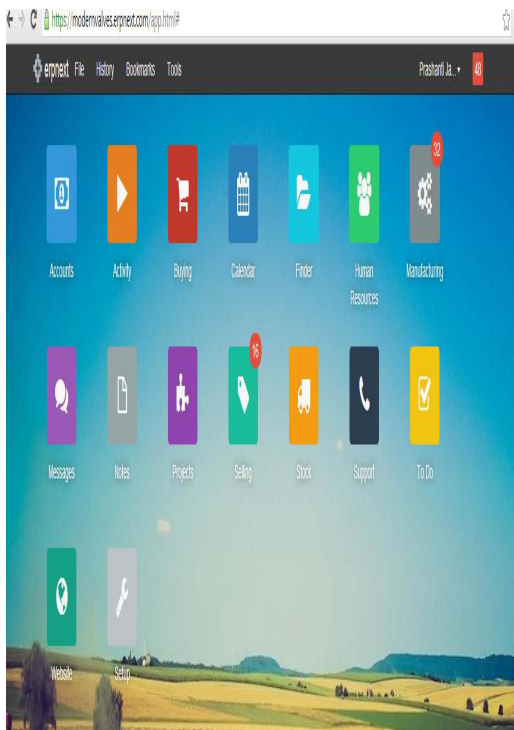
Fig. 1 Modules of ERPNext