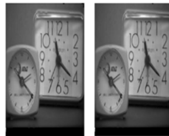
Fig. 3: Normal and Proposed Image Fusion