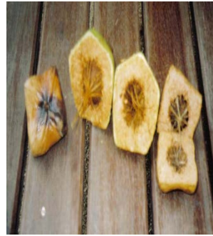
c. Sea coconut