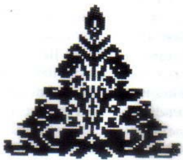
a. Pucuk Rebung (Mangosteen Stalk)