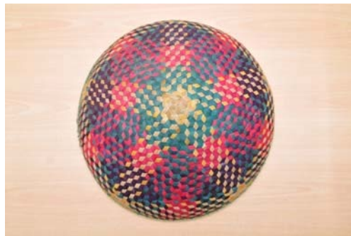
Figure 2: Woven straw for food cover