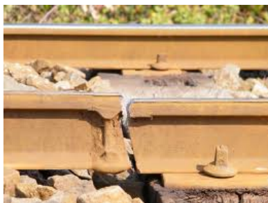
Figure.1 Railway Track Defect

Neural Networks can result in such devices which are able to detect faults in those areas where fault detection is difficult for human beings. Eg: fault detection in tracks of Railways, Metros and Roller coasters. And fault detection in mechanical parts of machine. Neural networks can detect patterns so it can detect faults when the railway track do not resemble its original shape i.e. having distorted shapes or having gaps, cracks or bents in it. These neural can be combined with a gps to locate their position as well as the position of crack. Also The health of tracks can be checked by measuring their width, inclination and condition of screws. This in turn can be of great use to avoid accidents. Visual fault detection of large or broad machine parts is difficult for human beings and it is time consuming too but neural networks can do this job with high accuracy because they can easily detect patterns, so even a little crack in the part will be visible to them.