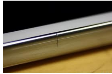
Figure.2 Small crack in a mechanical part