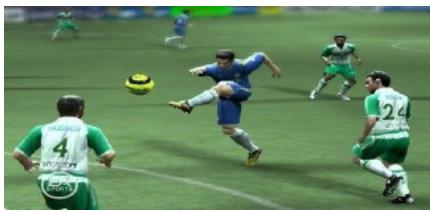
Figure.5 FIFA (video game)

Modern computer games usually employ 3D animated graphics (and recently also 3D sound effects) to give the impression of reality. The AI found in most computer games is no AI (in the academic sense), but rather a mixture of techniques which are although related to AI mainly concerned with creating a believable illusion of intelligence [6]. The phrase "game AI" covers a diverse collection of programming and design practices including path finding, neural-networks, and models of emotion and social situations, finite state machines, rule systems, decision-tree learning, and many other techniques.