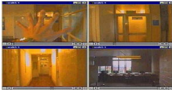
Figure.6 Radiosity for Virtual Reality Systems:

method using Neural Network technology is shown.