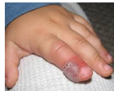
Figure.3 Skin Infection

Neural networks can assist doctors by suggesting the type of medication and treatment required for the patients. It can analyse the symptoms either by listening to the patients using CBR (case based reasoning) or by visual detection of wounds, skin infections, or swelling. Simultaneously It can provide an overall fitness level of the patient by analysing weight, heart rate, blood pressure, blood sugar levels, temperature and shivering (vibration). By analysing the above parameters on a combined level neural networks can suggest the best medication and treatment without consuming much time. This is possible because neural networks work by considering the probability of symptoms. The more the probable symptoms of a disease the more severe it is. Neural networks can also report new disease by checking the symptoms from a database. Moreover in case of known diseases neural networks can also suggest all the required precautions, diet plans and amount of dose of medicines.