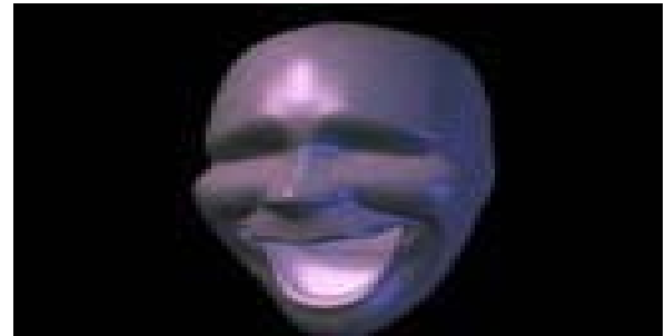
Figure 8 Facial animations using bicubic B-spline

the key shapes were interpolated to create the final animation